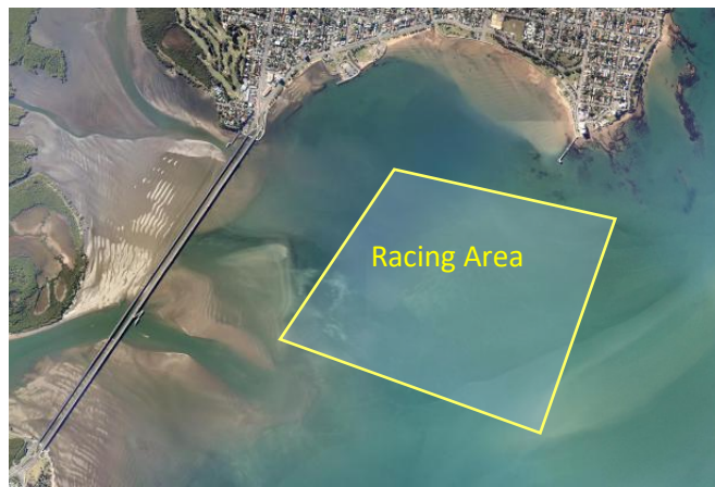
Figure 11.1 – Racing area

11.1. The racing area will be on the waters of Bramble Bay on a course dedicated to only participating yachts.