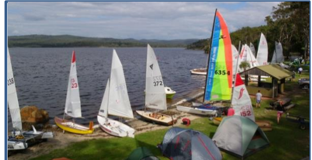
Monohulls 114 - 139

There are many places to stay in the nearby communities of Merimbula and Tathra.